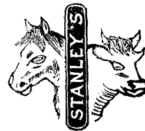
TRADE MARK REGISTERED.